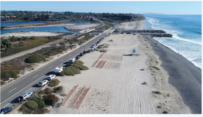
PONTO BEACH, CARLSBAD