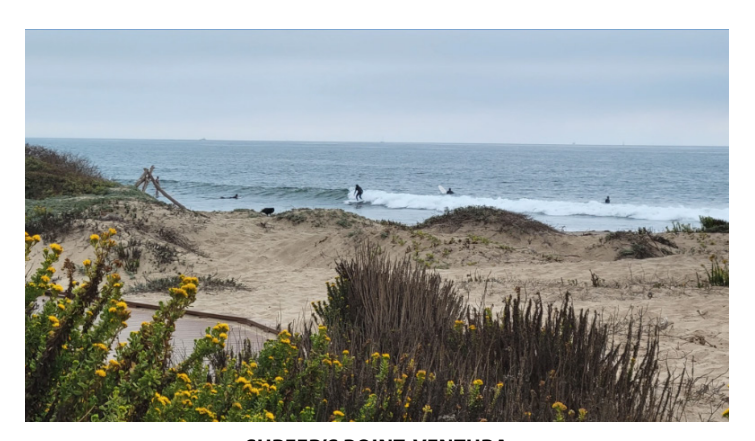
SURFER'S POINT, VENTURA