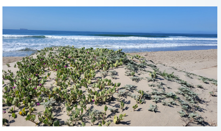
ORMOND BEACH DUNES & LAGOON