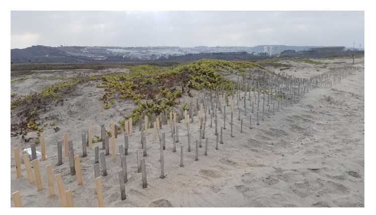
BORDER FIELD STATE PARK

Community Partners: Local and state coastal and beach managers from San Diego to Santa Barbara